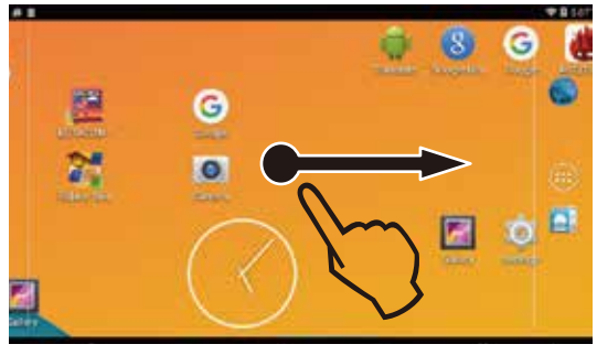
LSlide to page up/down